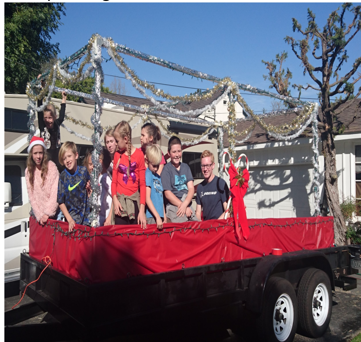
Some of the decorating crew from last year.