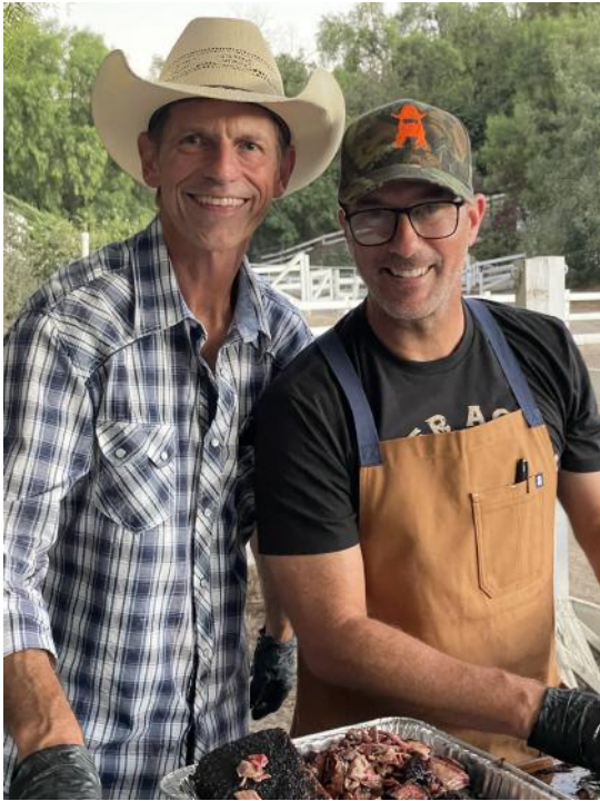
Gregg, where are you?!?

The food lines were not as overwhelmingly long as they have been in the past with Babek and Jenny's new design.