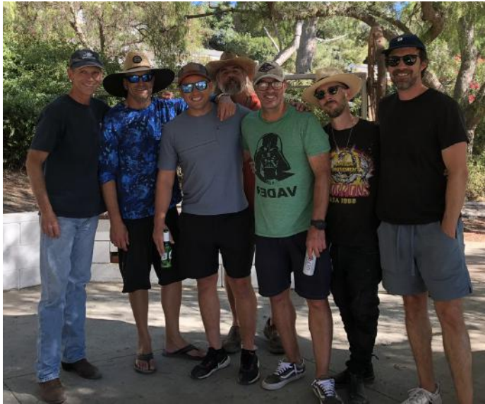
Hot neighborhood guys